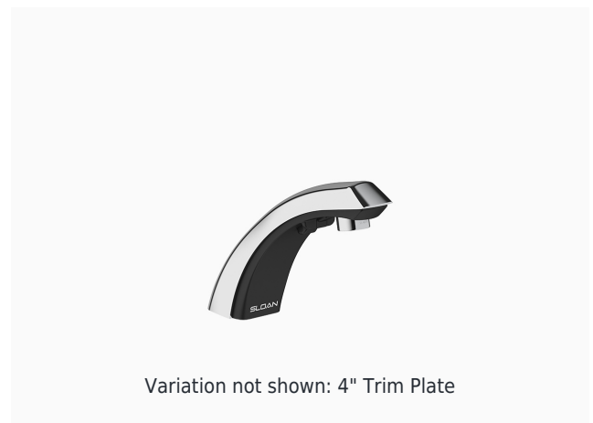
Variation not shown: 4" Trim Plate